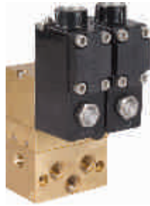
5/2 Single Solenoid with Redundancy in Operator Type: 51427

Contact Rotex for • Any other ambient, fluid temperature, media and application • UL listed, Listed general purpose Valve